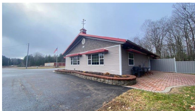
May May's Café: WWBIC/SBA Loan