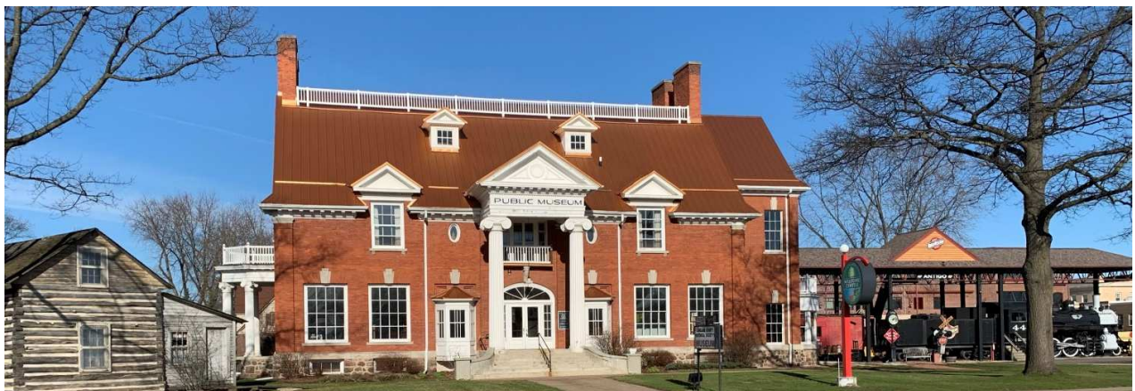
Antigo • Langlade County Welcome Center