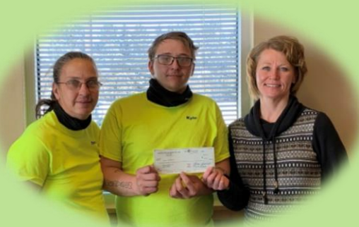
Robertson Hot Shots, LLC

MISSION: TO ADVANCE AND MAXIMIZE ECONOMIC OPPORTUNITIES IN LANGLADE COUNTY FOR BUSINESSES, COMMUNITIES, AND PEOPLE!