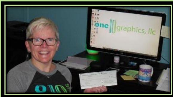
One 10 Graphics