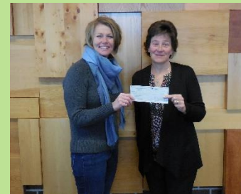
Mindful Journey Cycling