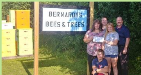
Bernarde's Bees & Trees