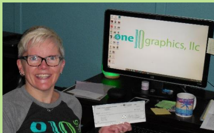
One 10 Graphics, LLC