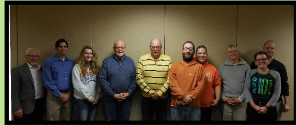
2019 Fall Graduating Entrepreneur Class