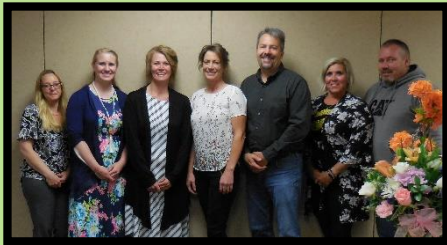
2019 Spring Graduating Entrepreneur Class