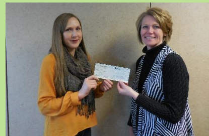
Little Renegade Kitchen