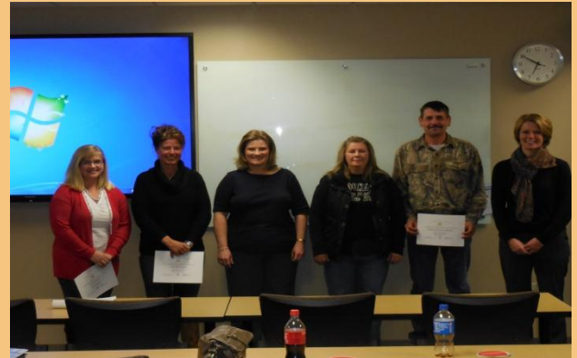
2016 Graduating Entrepreneur Class