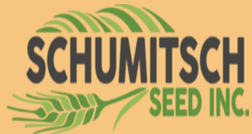
2016 Expansion Project