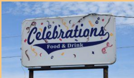
2016 New Business utilizing RLF