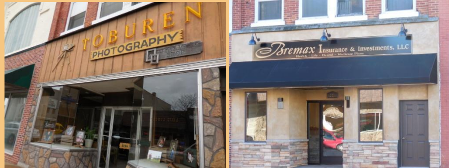
Downtown Entrepreneur Grant Project