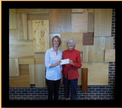
2016 Suick Family Foundation Grant Presentation to LCEDC