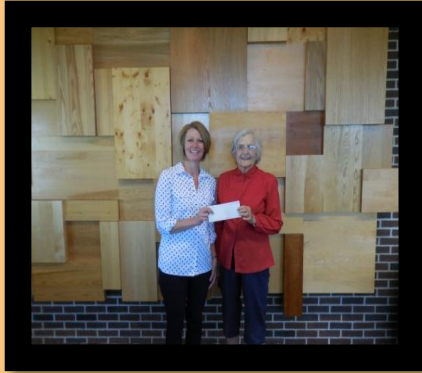
2015 Suick Family Foundation Grant Presentation to LCEDC