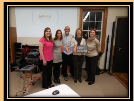
Discover Wisconsin Premier Party