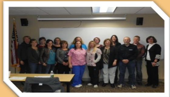
2015 Graduating Entrepreneur Class