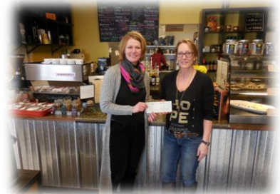
Sweet Thyme Business Plan Grant Award Presentation