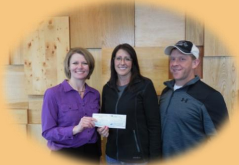
Great Northern Campground Business Plan Award Presentation