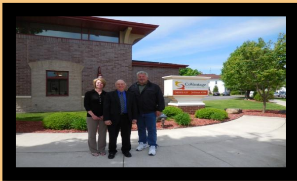
Downtown Entrepreneur Grant